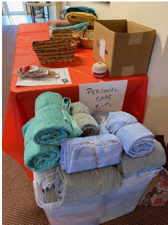
Personal Care Kits Assembly Table

Pics from God's Work, Our Hands Sunday, Sept. 10, 2023